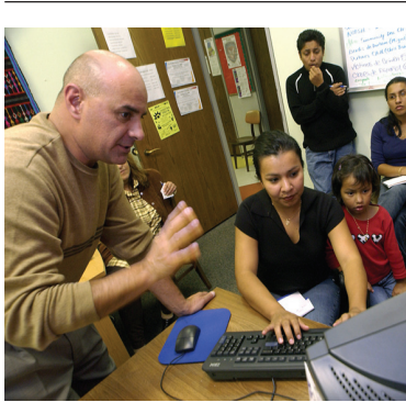
¡TradúceloAhora! is an IBM program that automatically translates Web pages and emails from English to Spanish and vice-versa.